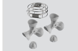
Specific squeezing kit

Juice extraction kits and blade that adapt to the orange size and hardness. Exclusive feed system that avoids jamming. Juice extraction speed that adapts to the specific resistance of orange.